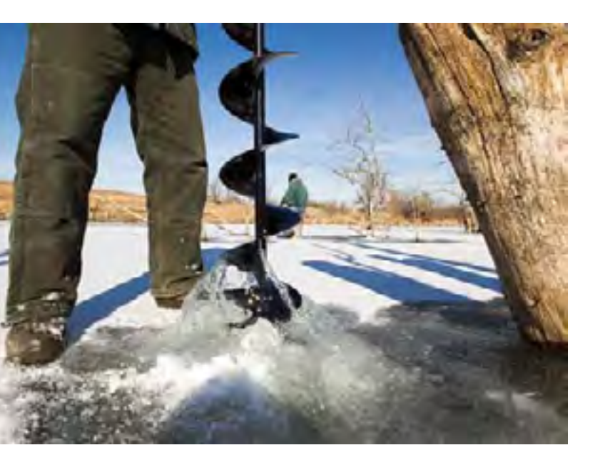
A 6- to 8-inch hole is wide enough for Missouri ice fishing. An auger, axe, or ice pick will get that job done.

"Is the ice safe yet?" is the first question to ask, and the most important consideration. It is impossible to determine if ice will hold you just by the appearance from the bank. Ice strength is determined by such factors as ice thickness, daily temperature, snow cover, depth of