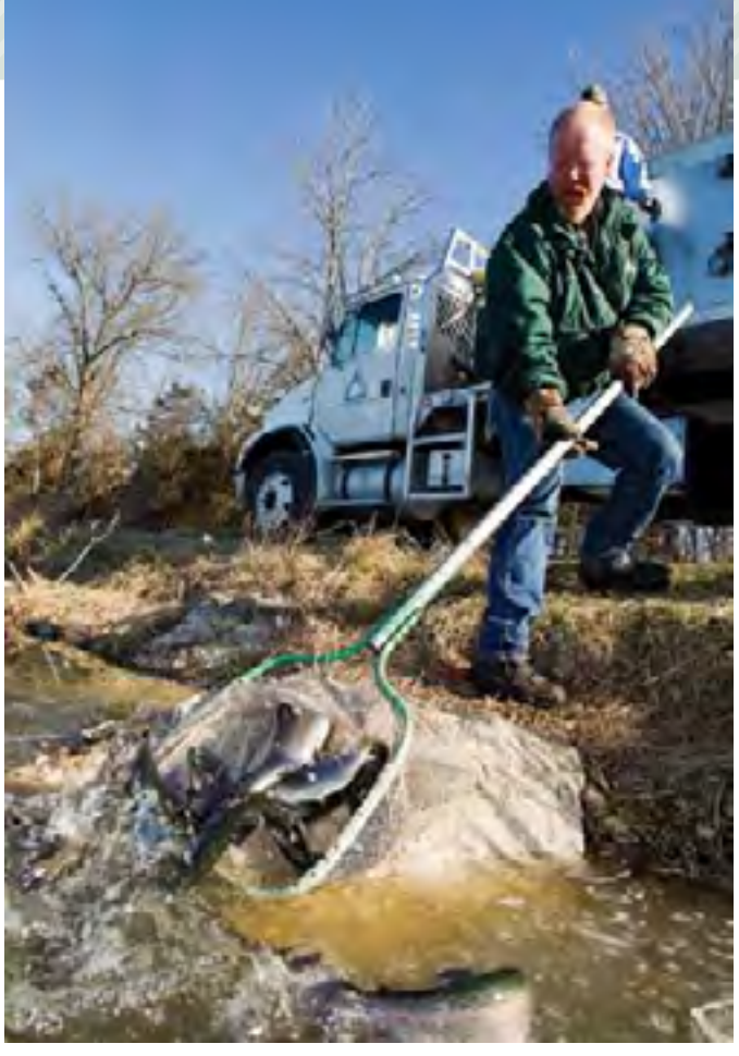
Department employees stock trout in urban lakes, such as this one at August A. Busch Conservation Area.

stream special management areas, and Lake Taneycomo. Trout parks sold 312,144 daily adult and 63,326 daily youth tags. Anglers purchased 94,894 annual trout permits.