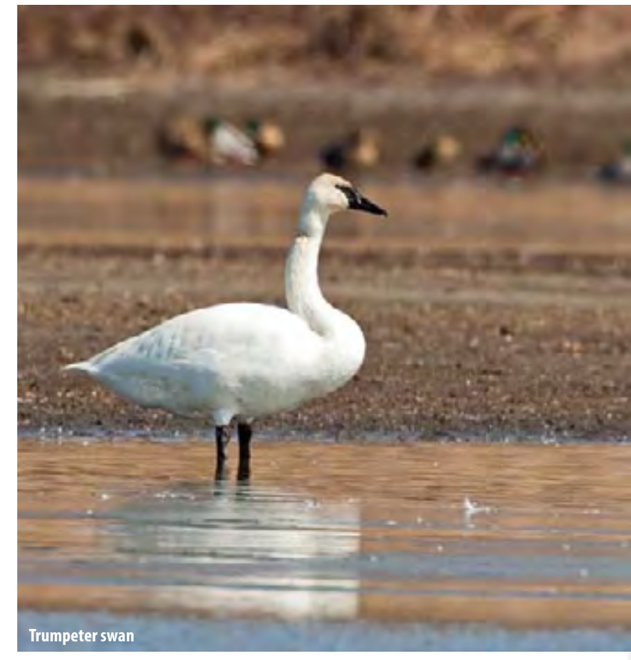
500mm lens +2.0x teleconverter • f/11 • 1/320 sec • ISO 200

While no camping is permitted on the area, people traveling the Missouri River by boat may camp within 100 yards of the river between April 1 and Sept. 30. The Missouri River and Perche Creek offer fishing opportunities for catfish, carp, buffalo, and drum. Hunting prospects include archery deer, dove, rabbit, squirrel, and waterfowl in season. Waterfowl hunters must obtain a daily waterfowl-