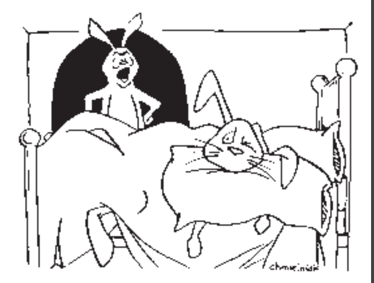
"Rabbits don't hibernate. You're just lazy !"