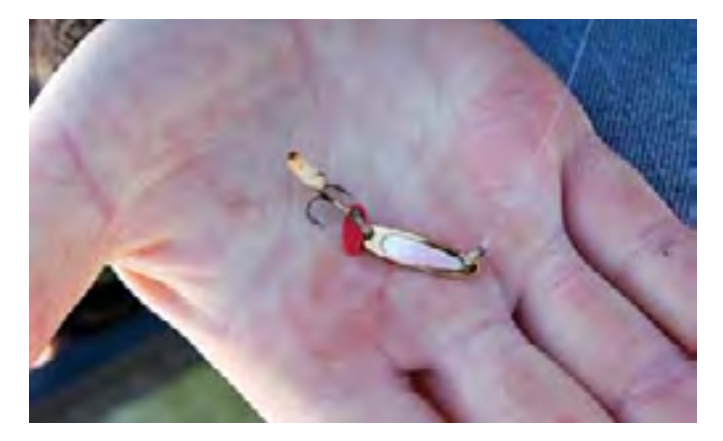
Many ice anglers use wax worms for bait. They can be hard to find some years because the ice-fishing season varies, but bait shops can order them for you.

Ask your friend or relative if taking a few fish out of their pond is ok, then find the deepest part of the pond, easily located adjacent to the pond dam. During win-