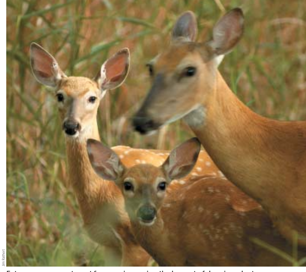
Future management must focus on increasing the harvest of does in order to control deer numbers. This strategy provides a bonus of more and bigger bucks in the population.

ment options and are formulating their recommendations for the 2004 deer hunting seasons. The regulatory options chosen likely will not be made statewide. Instead, they will be