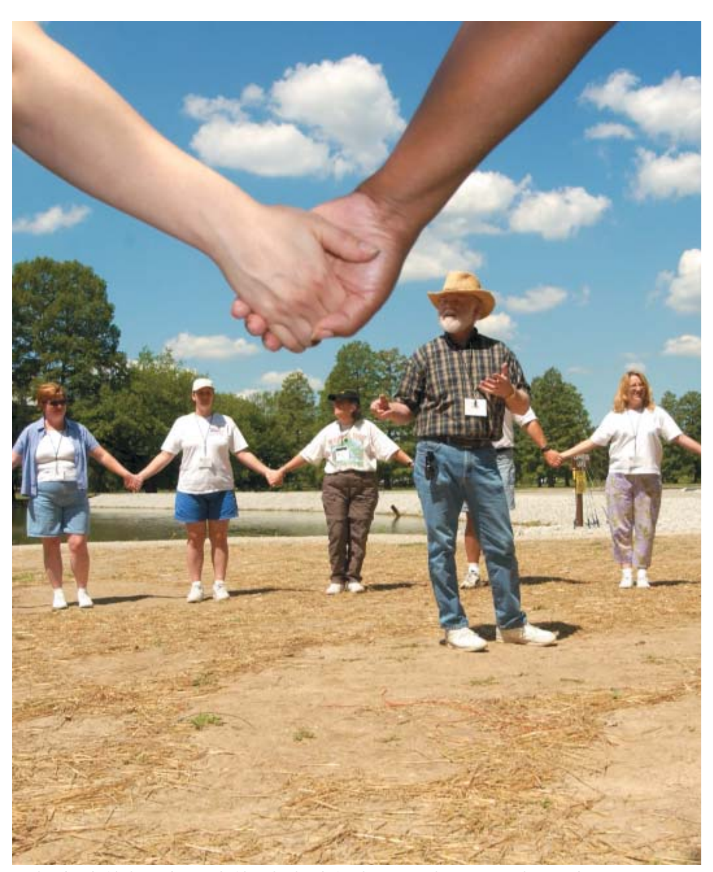
Teachers bond with the outdoors and with each other during the Forest Park Voyagers Teacher's Academy.