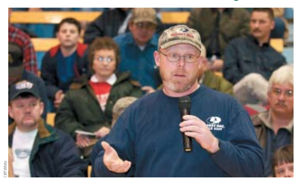
More than 4,000 concerned hunters and landowners across the state attended 19 public meetings and six special interest/conservation meetings held this winter to gather public input on ways to manage Missouri's deer herd.

For the first few years, the guiding principle of deer management was relatively simple: protect the does so the herd could grow. Wildlife biologists have long known that does are the key to successful deer herd man-