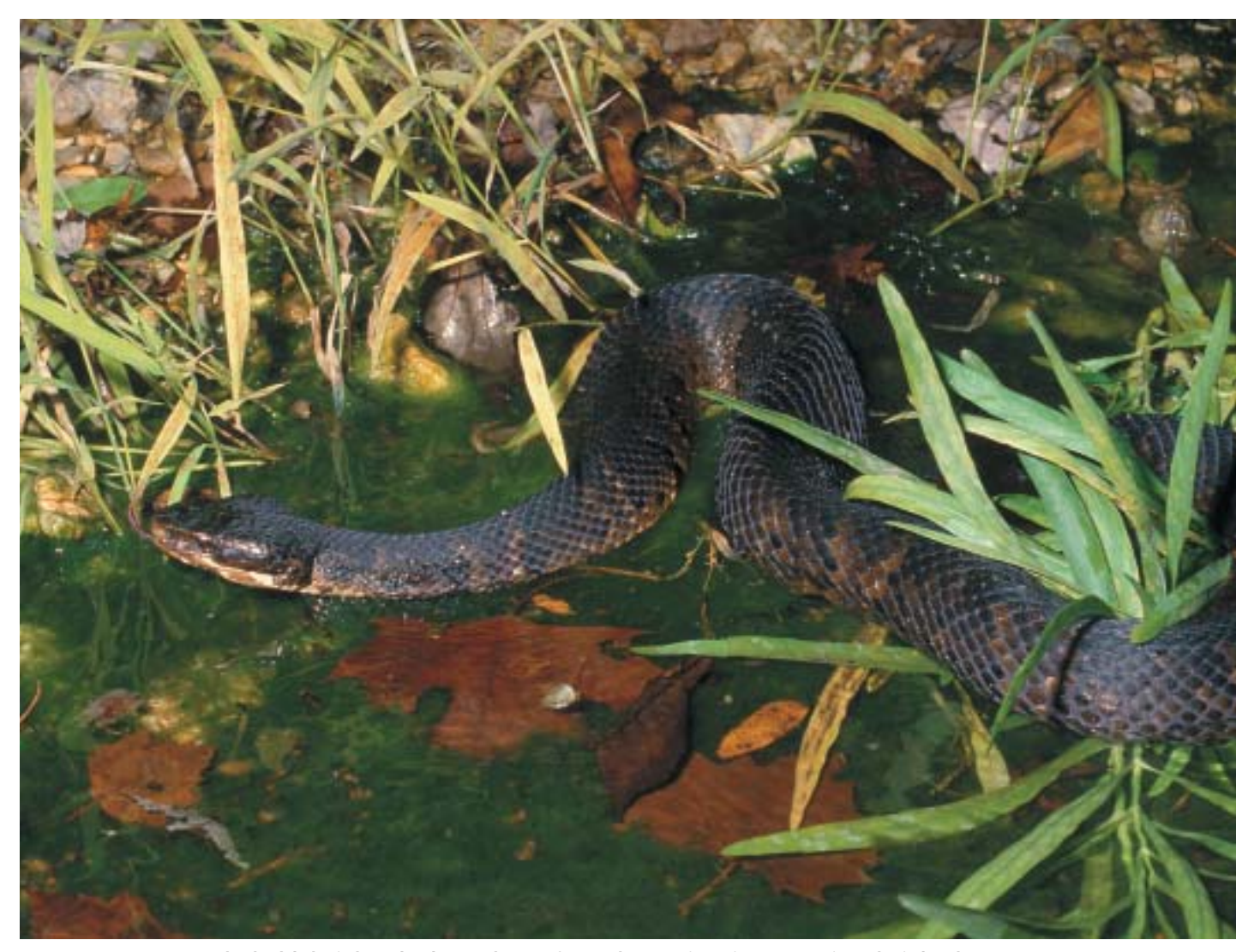
Western cottonmouths hold their heads above the surface when swimming, exposing their backs.

A bite by any of Missouri's venomous snakes warrants immediate medical attention. However, no human deaths from bites by native venomous snake have been recorded in Missouri in more than 30 years.