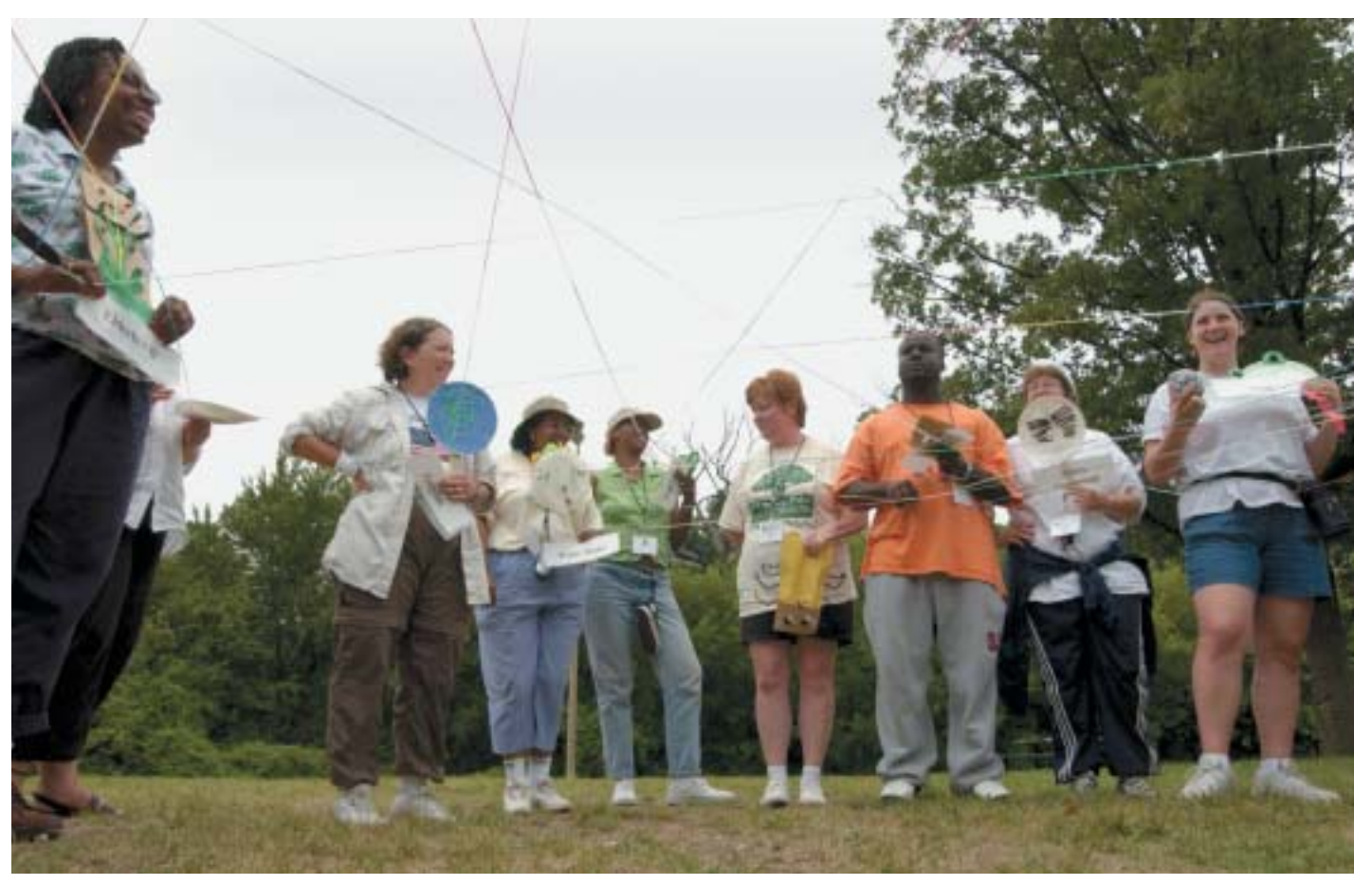
Teachers developed lesson plans and exercises to help their students learn about Missouri's plant and animal communities.

ated "Harmony in Kennedy." During this program, the students will connect nature with musical themes in Vivaldi's "Four Seasons" during several seasonal field trips to Kennedy Forest. Their students will create sound maps, word maps, poetry and artwork using only natural materials gathered using ethical techniques.