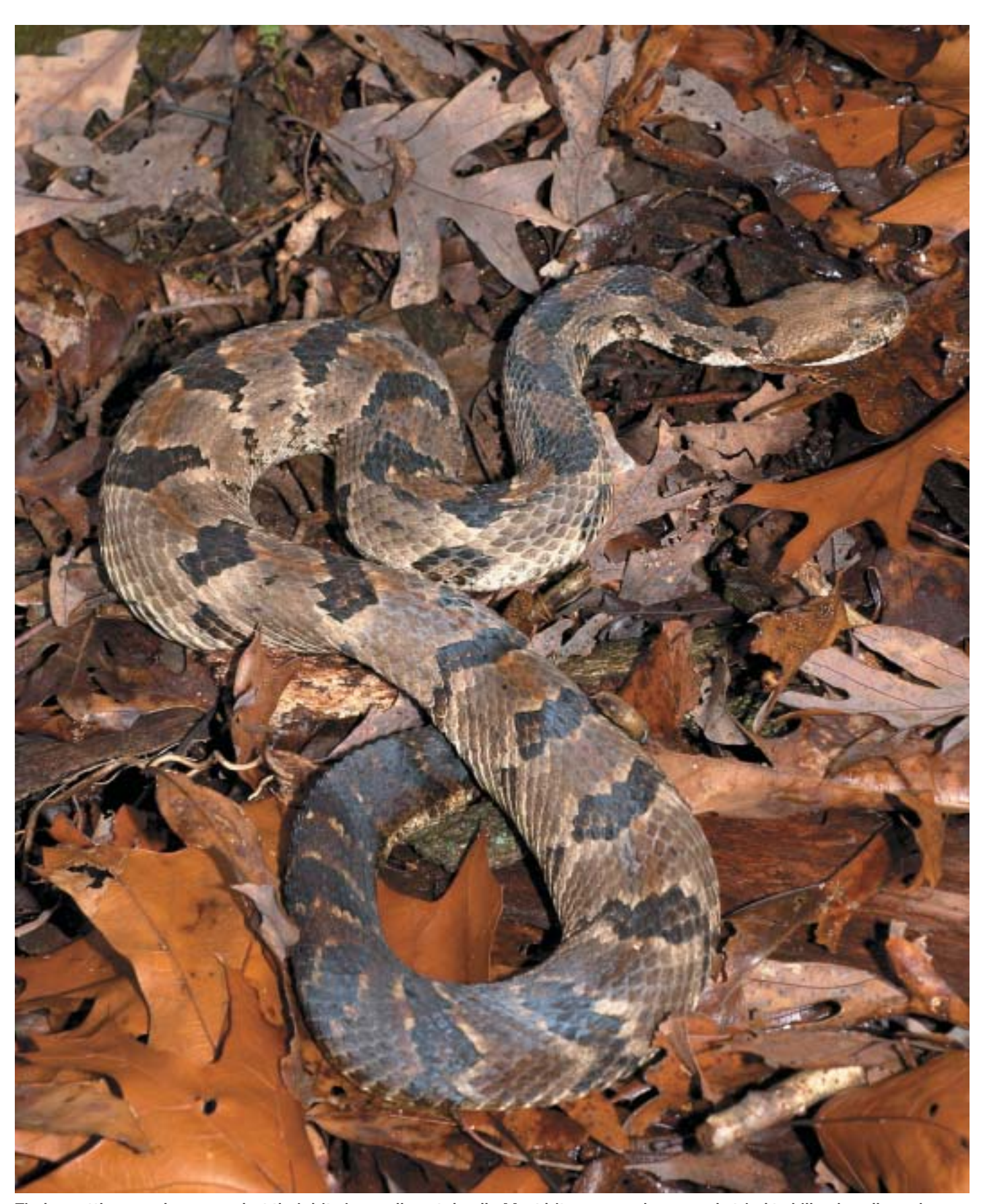
Timber rattlers are dangerous but their bite is usually not deadly. Most bites occur when people tried to kill or handle snakes.