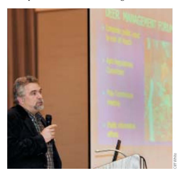
Conservation Department biologists presented possible management strategies at the meetings.

Biologists are evaluating the public response to the various manage-