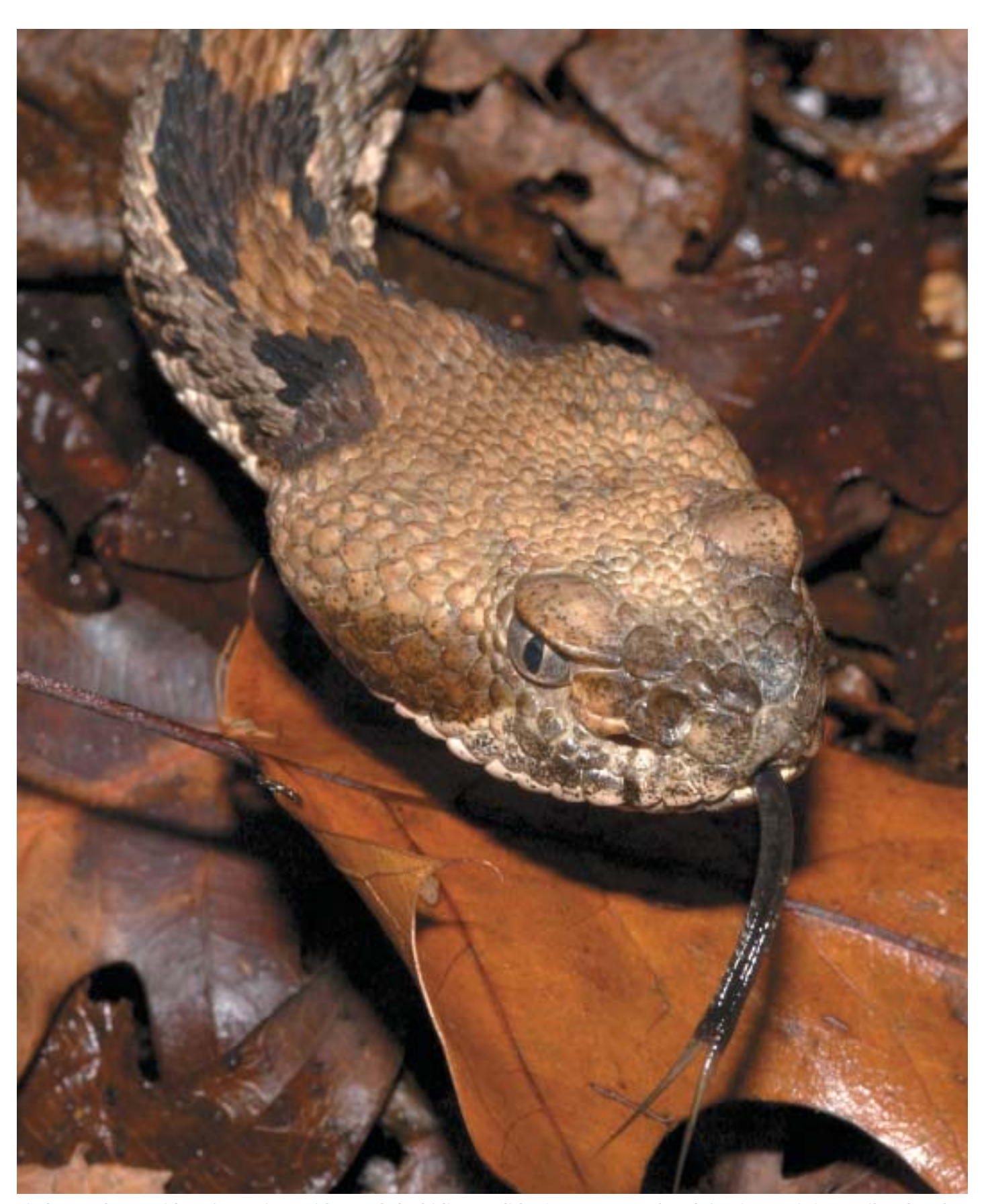
Timber rattlers avoid confrontations with people by hiding or slithering away. Another defensive tactic is to coil and rattle.