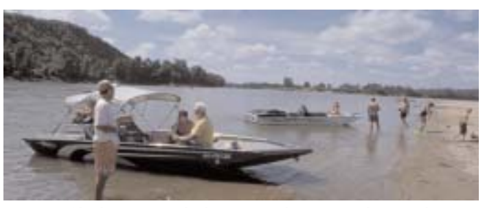
Lewis & Clark fans can help stem zebra mussel spread Conservation agencies have a favor to ask of the thousands of people expected to celebrate the Lewis and Clark bicentennial with Missouri River boating excursions: Please help stop the spread of zebra mussels.

Wherever it goes, the small, seemingly insignificant clam is causing tremendous damage to industrial and boating equipment. It is also devastating native mussel populations and upsetting the ecological balance of lakes and streams.