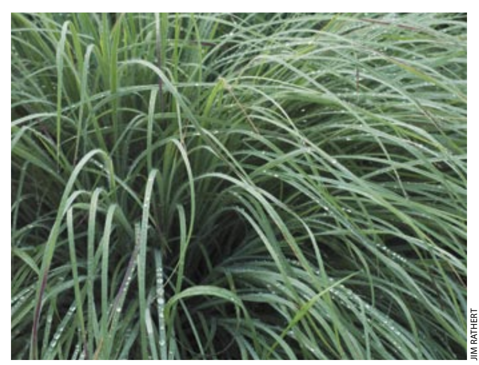
Native warm-season grasses, like this little bluestem, improve livestock forage and quail habitat. Hubble Elementary School students (opposite) search for aquatic life in a pond graced by native water lilies. The pond is in their school's restored "Secret Garden."

"Secret Garden is a great way to do cross-curricular activities, and I encourage other schools to develop their own if they can," Lael said.