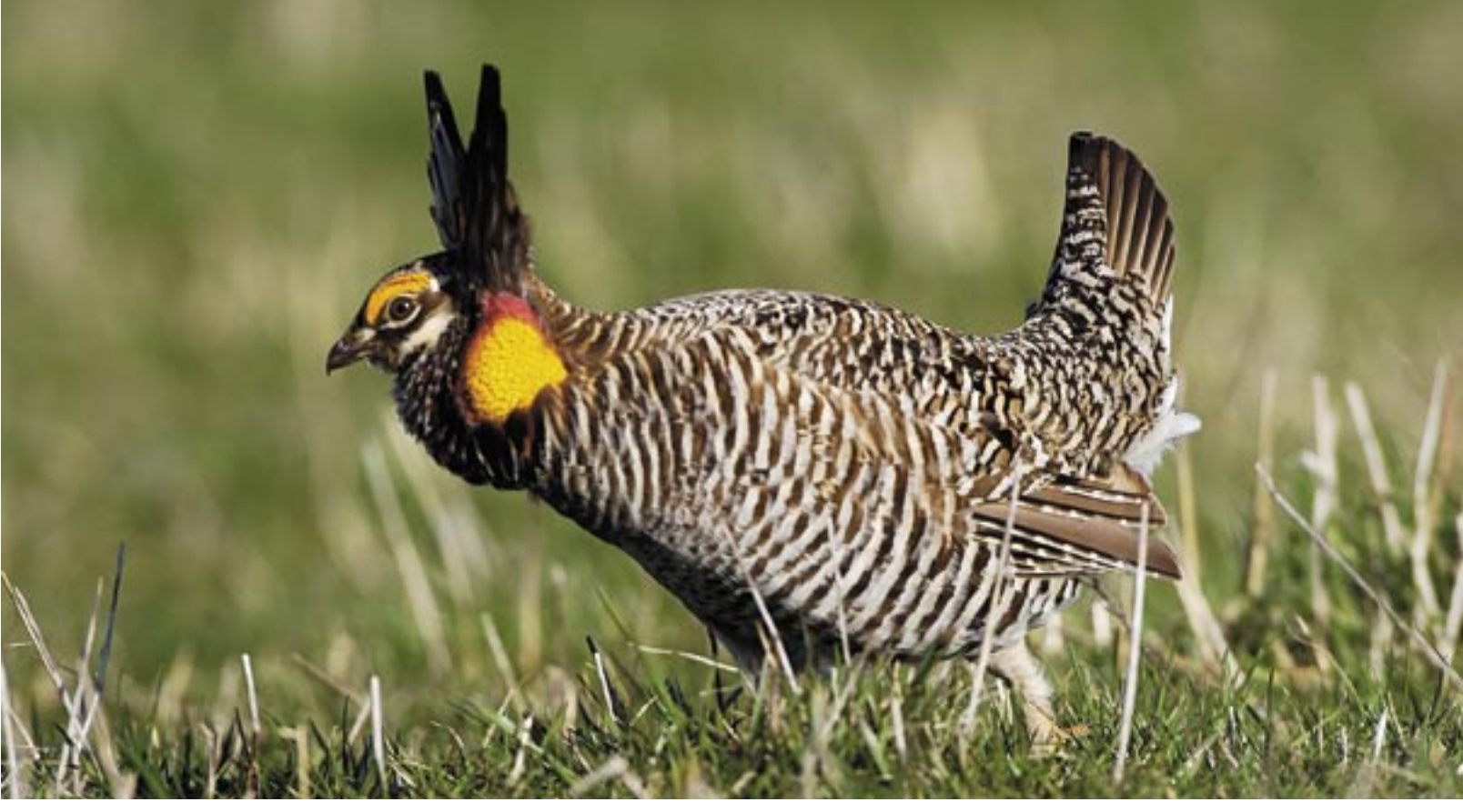
Prairie chickens and other grassland species will benefit from the Grassland Coalition's efforts to increase prairie habitat.

on public land on behalf of grasslands wildlife, stabilizing these populations requires that habitat improvements be expanded on private land. Fortunately, private landowners have expressed interest in a wide range of projects, and have demonstrated long-term commitment to improving their grasslands.