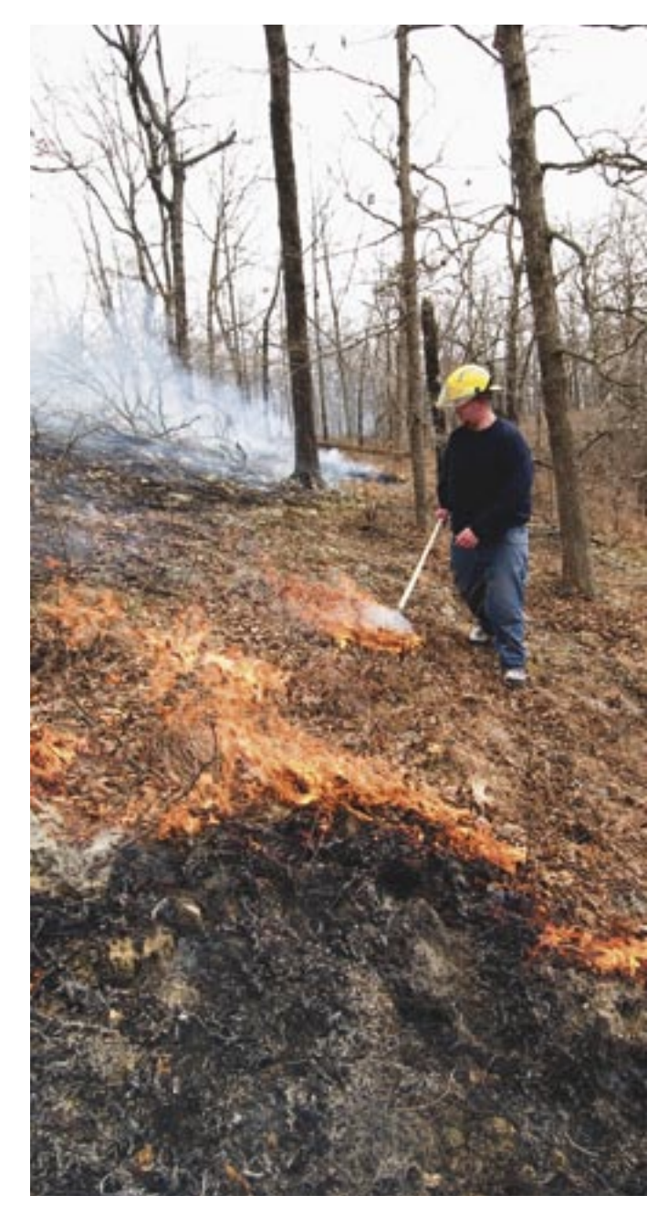
Improved training and equipment helps firefighters battle wildfires that threaten Missouri's forests.

In addition to mutual aid agreements with the Conservation Department, most local fire service organization also have agreements with neighboring fire departments. In times of fire disasters, a system of statewide mutual aid can bring help wherever needed. In the fall of 1999, this system resulted in a coordinated