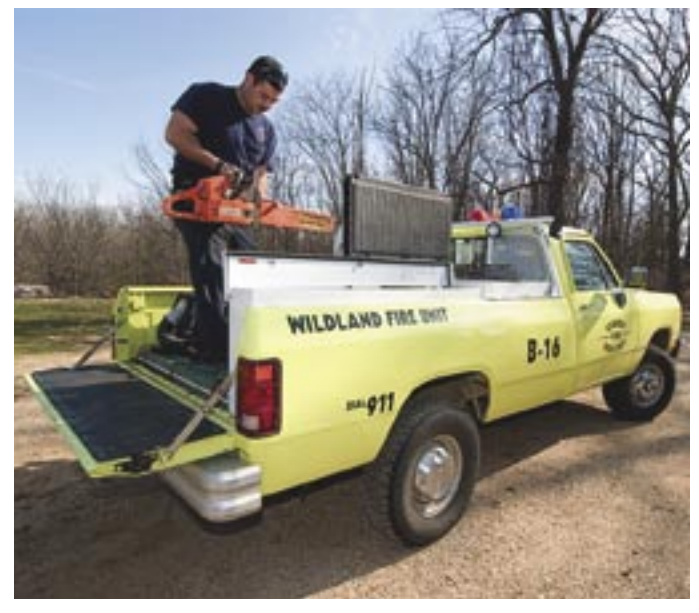
The Federal Excess Personal Property Program supplies rural fire departments with much-needed equipment.

from the bare hills deposited this precious soil into streams and rivers, where it was carried away forever.