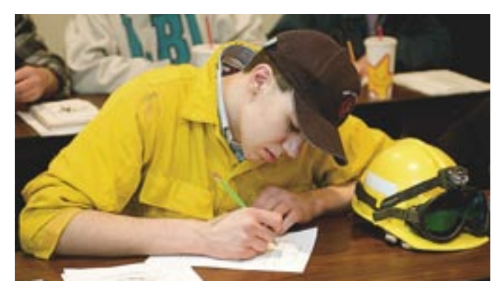
The Conservation Department provides valuable training to rural volunteer firefighters.

In many areas, erosion of the thin top layer of soil undermined an area's ability to regenerate vegetation. Steep, barren hillsides and other areas where the forest floor was unprotected were vulnerable to erosion. Runoff