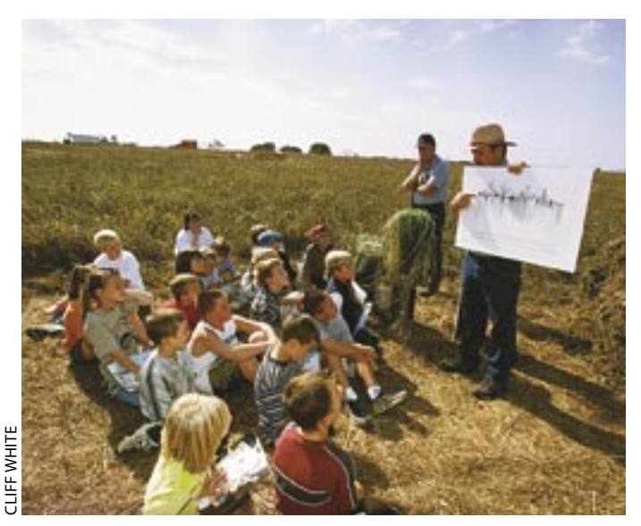
During an "education day" at Taberville Prairie Conservation Area, youngsters learn about prairie plants.

The cooperation of willing landowners within focus areas is crucial to the efforts. Although much work is done