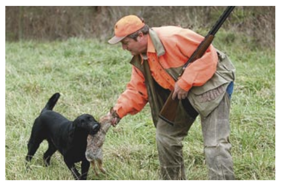
My lab often fetches rabbits that I thought I had missed.

They learned that the next morning. Overnight, a thin sheet of ice formed on the water. A swamp