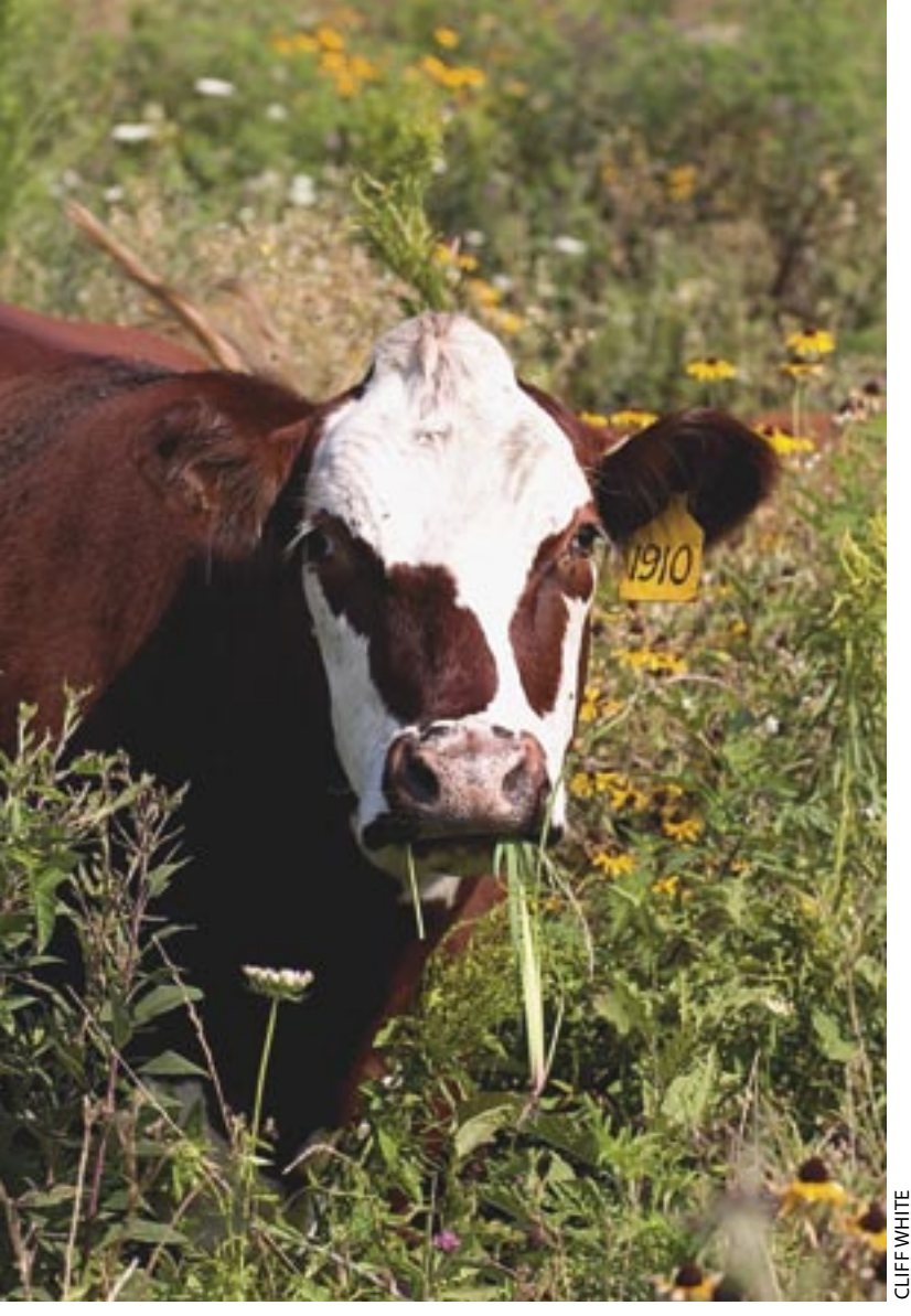
In the hot summer months, cows quickly gain weight eating native grasses and wildflowers.