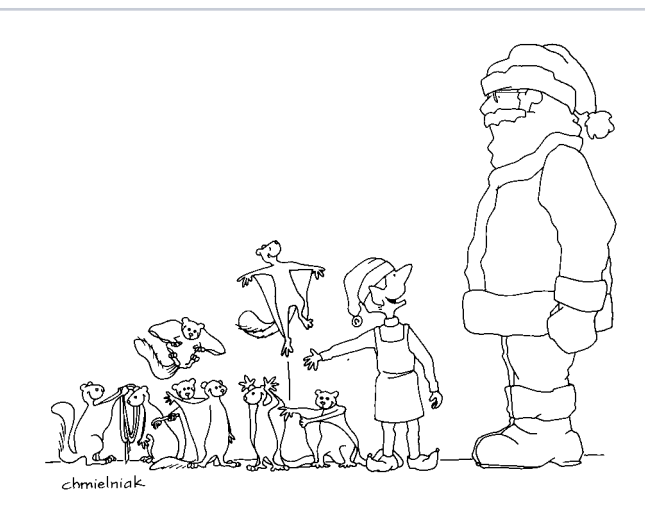
"Hey Santa, the flying squirrels convinced the reindeer to let them pull the sleigh!"