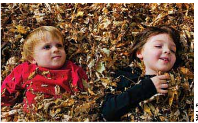
In November, rake leaves for your kids to jump in.

Feed the birds. Help your kids coat pine cones with peanut butter, roll them in birdseed and tie a string to their stalk. Hang up these "all natural" bird feeders, and in no