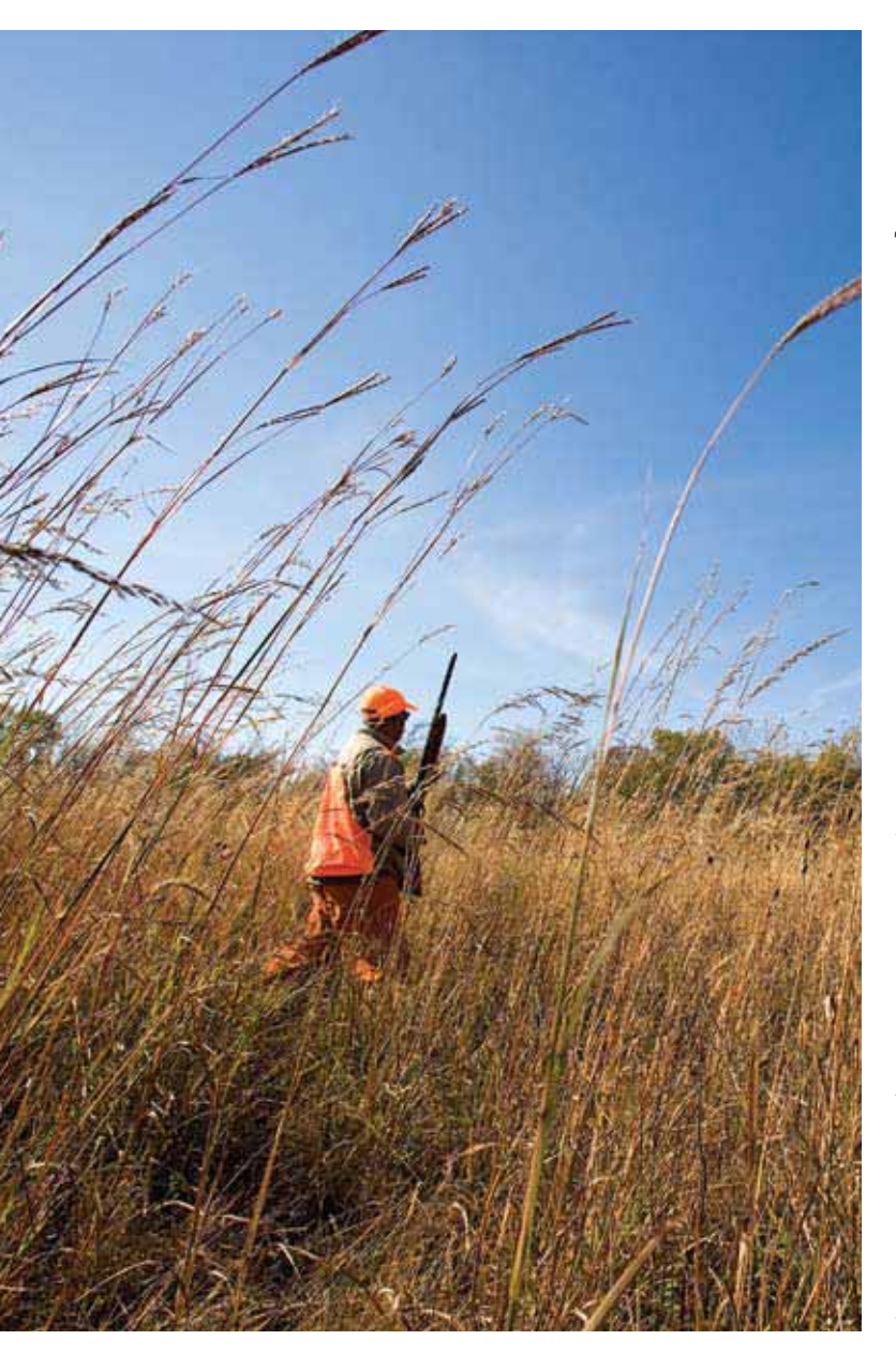
The MOILMICANE Hunting Group's annual hunt now takes place south of Des Moines, where there are plenty of pheasants to hunt for all the members.

ly cock their eyes from side to side. It's easy to imagine some of them wishing they'd gotten their affairs in order. During the group's annual hunt, 40 or more disciplined hunters and a platoon of bird dogs may work the same