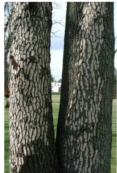
Increased woodpecker activity on ash trees leads to bark blinding, which can be a sign of EAB.

Walnut trees with thousand cankers disease