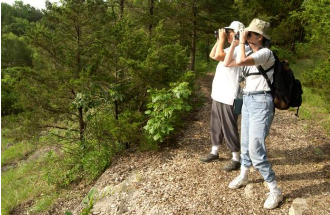
Bird watchers at Painted Rock Conservation Area

Missouri Department of Conservation May 2017