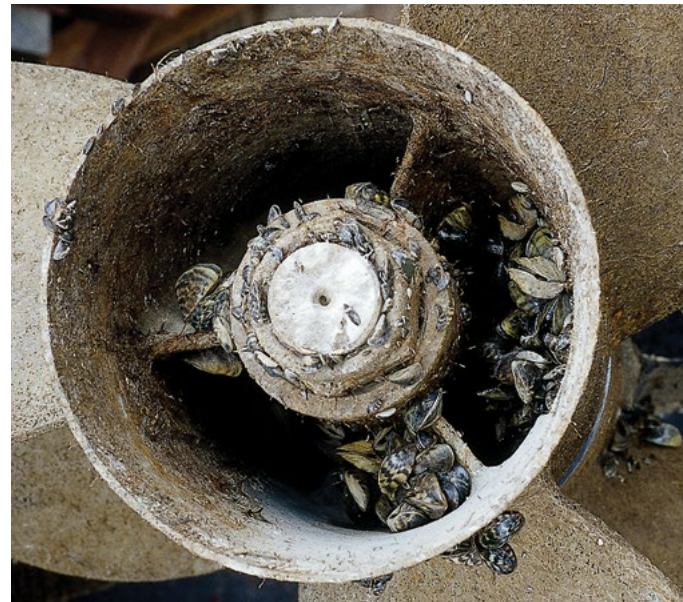
Zebra mussels hitch rides and clog boat propellers.