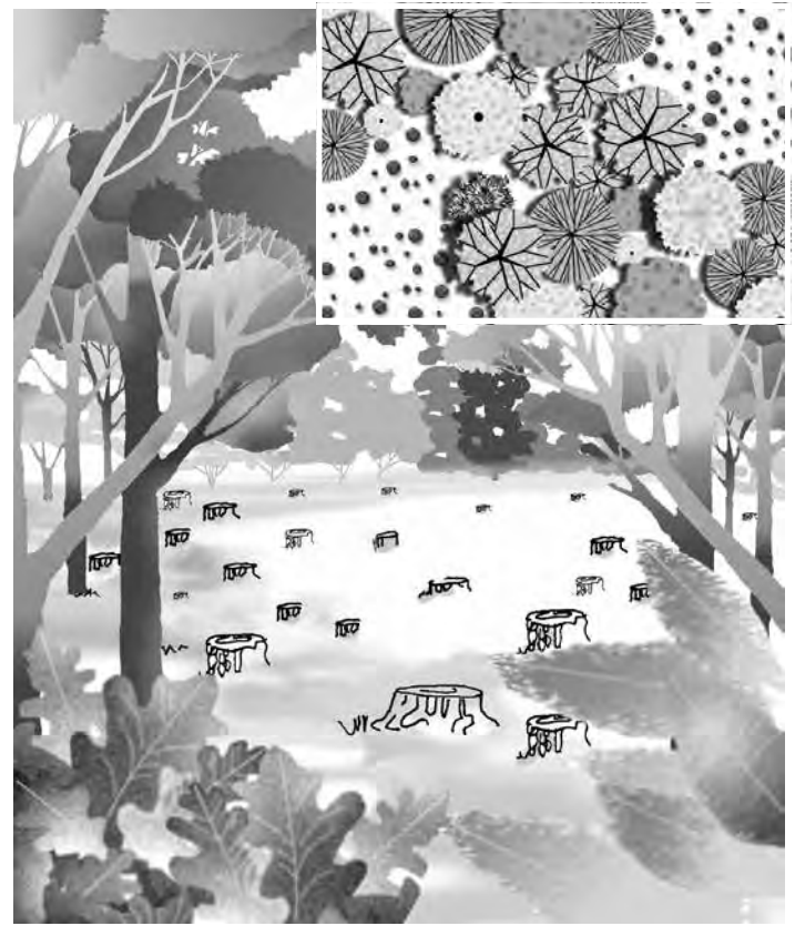
The temporary forest opening method harvests small groups of trees resembling miniature clearcuts, which produces high quality grouse habitat. See overhead view, above right.

of advanced oak regeneration is to use prescribed fire to kill shade tolerant trees that may be competing with oak saplings; see Prescribed Burning section on the following page for additional information.