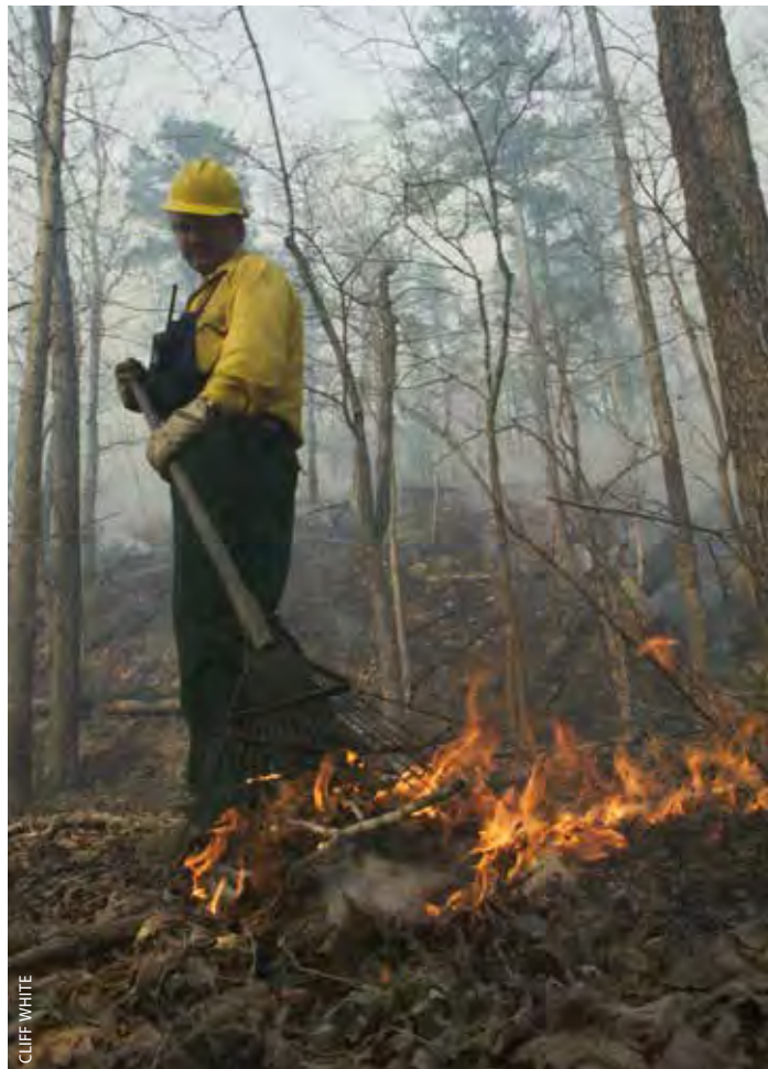
Burning young forest stands can improve these areas for grouse broods by reducing coarse woody debris and shade-tolerant species, and by increasing insect numbers following the burn.

Oaks are a fire-adapted species that have many characteristics that allow them to be resilient to fire. Oaks have relatively thick bark and the ability to re-sprout rapidly following fire, allowing them to outcompete less fire-tolerant species. As such, low-intensity prescribed burning is a great way to improve the quality of oak forests for grouse. Burning young forest stands can improve these areas for grouse broods by reducing coarse woody debris and shade-tolerant species, and by increasing insect numbers following the burn. Managers should create a mosaic of burned areas by burning different portions of an area on a 1–4-year rotation. Prescribed burns should generally be conducted during late winter, when they reduce damage to