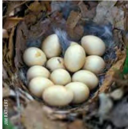
During spring, male grouse establish territories around one or more drumming logs. Drumming sites are typically located on upper slopes within or adjacent to patches of young forest and offer good visibility at ground level with dense overhead cover. Female grouse typically establish spring nests in mature forests with open understories, often next to a tree or fallen log.