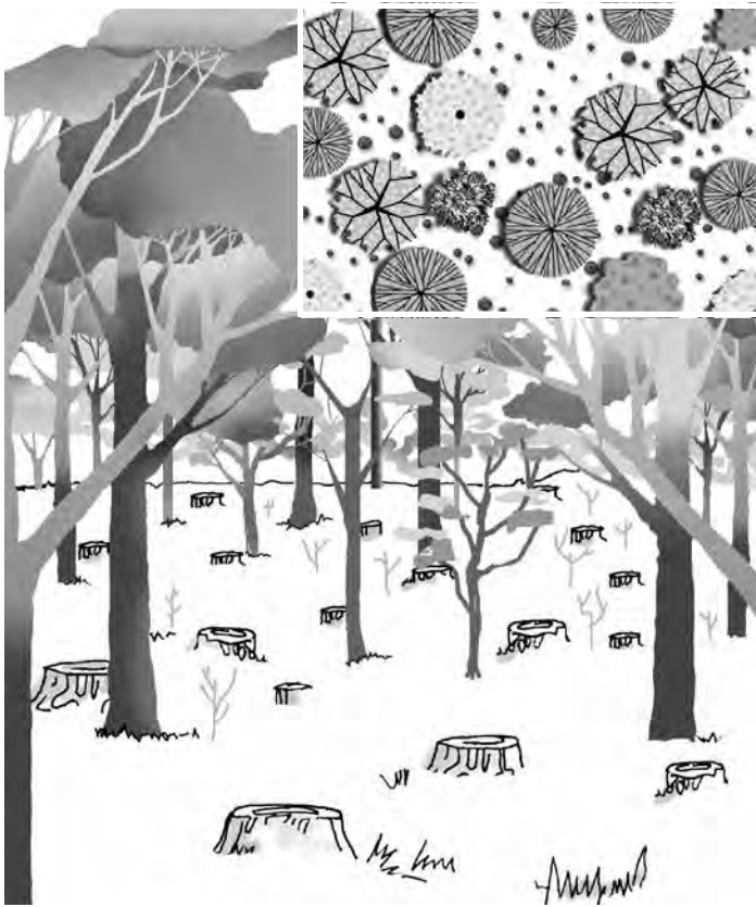
In the shelterwood method, a new stand is established under the partial shade of older trees that provide cover and food for grouse. See overhead view, above right.