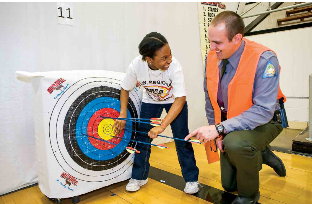
Agents provide programs and outdoor skills clinics to civic groups, schools, and other organizations interested in conservation.

Conservation agents respond to the public through an intense public relations and educational program. Agents' success is measured by their performance of the following duties: contacting resource users and landowners; holding meetings; conducting hunter safety and ethics instruction; appearing on radio and television programs; providing information at fairs and exhibits; writing newspaper articles; and providing programs for schools, clubs, and organizations.