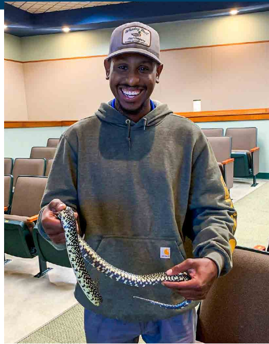
Volunteer and intern positions frequently put participants in direct contact with wildlife.

Protection Branch offers a volunteer program (Protection Volunteer Program) and paid internship opportunities that allow qualified applicants the chance to ride-along with conservation agents and gain experience in resource law enforcement, public education programs, fish, forest, and wildlife management, and more. MDC provides as many opportunities as possible to qualified, well rounded, diverse applicants, regardless of their levels of resource law enforcement experience.