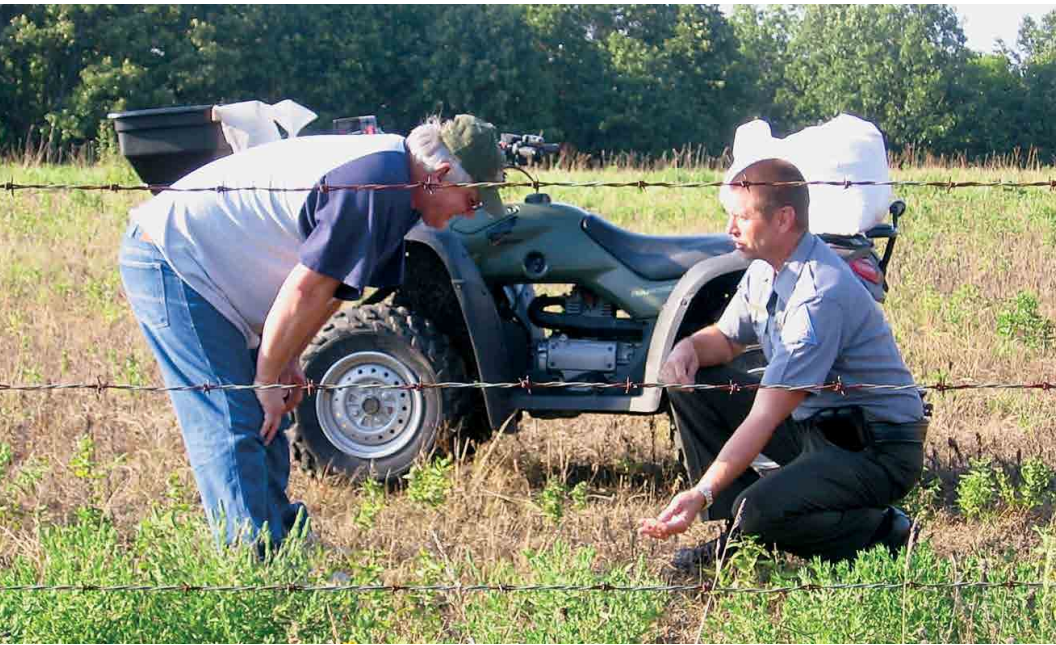
Agents visit with landowners individually and provide resource management assistance.

Management duties in wildlife, fisheries, and forestry are determined by the agent's assigned area. Wildlife management involves surveying wildlife populations, making landowner habitat improvement contacts, investigating wildlife damage complaints, and other wildlife-related duties. Duties in fisheries management include conducting pollution investigations, assisting in fish distribution, monitoring fish rescue efforts, advising landowners on lake and pond management, and other fisheries-related duties. Providing forestry development advice to private landowners and forest fire investigations are just a couple examples of the many responsibilities in forestry management.