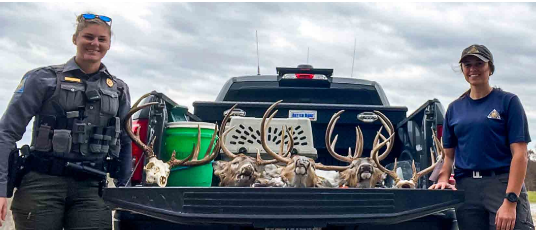
Volunteers and interns assist conservation agents in investigations and resource law enforcement.