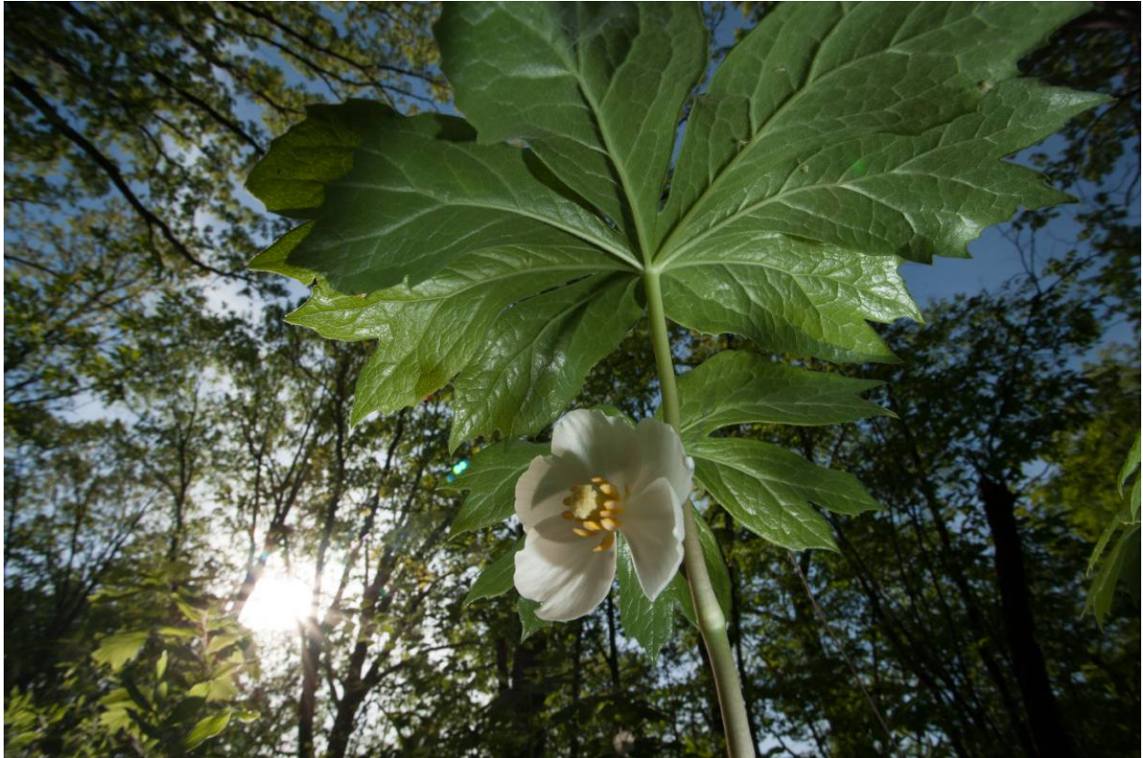
May apple growing at Diana Bend Conservation Area

Missouri Department of Conservation January 2015