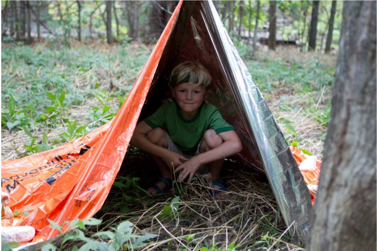
Three Creeks Conservation Area

Missouri Department of Conservation May 2016