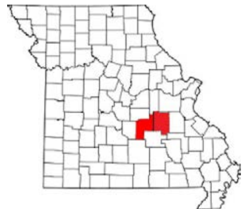
Phelps and Crawford Counties

From Highway 8 bridge to Scott's Ford and in Dry Creek Fork from the elevated cable crossing to confluence with Meramec river