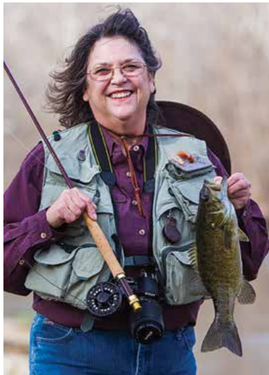
To catch largemouth bass with a fly rod, use a heavier 6- to 7-weight rod with a fast tip.