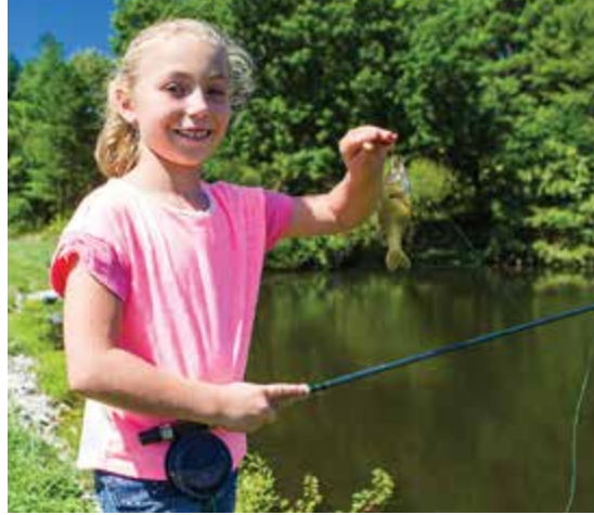
Even a small bluegill caught on a fly can put a big grin on the face of young and old alike.

I can recall one particular catfishing trip when a fishing buddy and I took our float tubes to a private pond where it was rumored that the average-sized catfish would put fear into Godzilla. We were not entirely convinced until the first of the man-beating monsters grabbed a Clouser minnow streamer fly I had tied just for this adventure. I should have worn my cowboy hat and boots for that rodeo. That fish