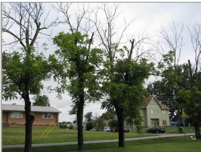
TCD infected walnut trees in Tennessee

Thousand cankers disease (TCD) has not been detected in Missouri but represents a serious threat to our black walnut resource. A couple weeks ago, TCD was reported in Virginia. This is the second state in the eastern range of black walnut with TCD detections, and also means TCD has been detected in states on both coasts. In addition to Virginia and Tennessee, 9 western states (WA, OR, ID, CA, NV, UT, AZ, CO, and NM) have had TCD detections.