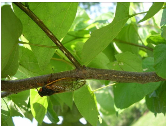
Periodical cicada and oviposition slits on redbud branch

Cool weather in the first and third weeks of May slowed emergence, which is dependent on warm soil temperatures. Emergence began at the southern edge of Missouri in the second week of May, progressed northward across the state, slowing during the third week, and finally occurred at the northern edge of the state by the end of the month. Cicada adult numbers were high through the first half of June, and then tapered off until most adults were gone by the end of June.