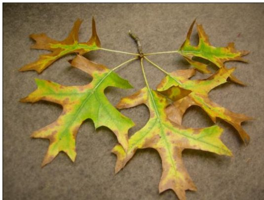
Bacterial leaf scorch symptoms on pin oak leaves