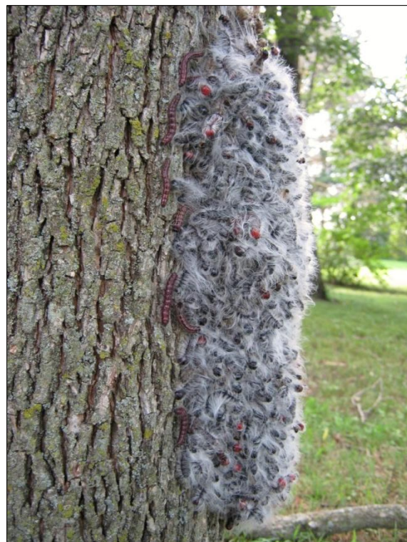
Clustering of walnut caterpillars during molting

Many types of defoliators have been out in large numbers this year. Walnut caterpillars have been reported in many locations, but most commonly across southwestern Missouri. The caterpillars feed on the leaves of black walnut, pecan, butternut, hickories, and occasionally a few other species. They are hairy and are a reddish color when younger and black when older. They move together in groups as they feed. Like all insects, walnut caterpillars must periodically molt (shed their