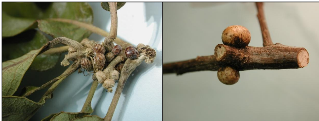
Kermes scales on post oak (left; brown, striped spheres) and on red oak (right; tan spheres)

Few studies have been done on the life histories of Kermes scales. But a general Kermes life history can be used as a guide for understanding the species in Missouri. There are two time periods during the year when crawlers are moving on the tree. Mature females, located on twigs, deposit eggs in June and possibly early July. The eggs hatch about a week after being deposited. Young scale crawlers then disperse to the trunk, large limbs, or remain on small branches. They feed and overwinter in those locations. In spring, at about the