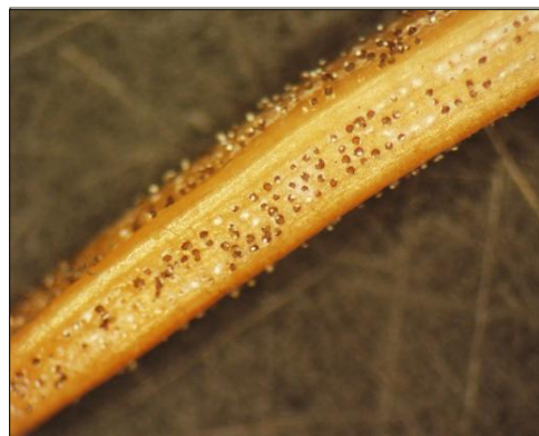
Small black fruiting structures of Rhizosphaera needlecast on spruce needles