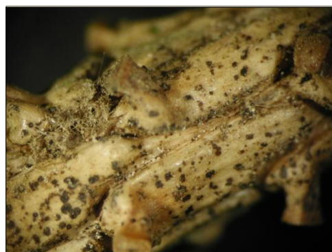
Small black fruiting structures associated with SNEED on spruce branches