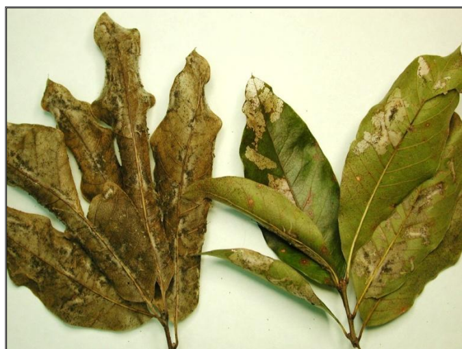
Skeletonized shingle oak leaves

A complex of moth caterpillar species that feed by skeletonizing shingle oak leaves periodically erupt at outbreak levels in parts of Missouri. They feed by removing tissue from the lower surface of leaves, and leaving clumps of brown fuzz (leaf hairs) on the leaf surface. Entire tree crowns can become brown. In 2010 outbreaks were seen in western and southern Missouri. This year, the first reports of heavier leaf damage have come from southeastern Missouri, primarily in a swath