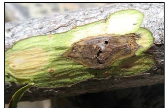
Symptoms of TCD include cankers and beetle tunnels under the bark of 1-2 inch diameter branches