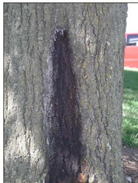
Signs of bacterial wetwood at the base of a pin oak

We have had recent calls about oozing liquid, strong odors and insects associated with cracks or wounds in trunks and large branches of oak and mulberry. There is no cure, other than to wash away the material when