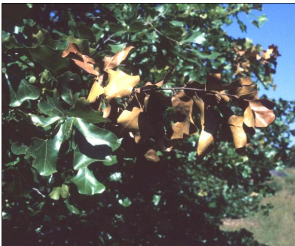
Branch flagging caused by cicada oviposition

Brown leaves appearing on individual branches scattered throughout the tree crown, or branch flagging, can be caused by many kinds of insects and diseases. Flagging is common now on many types of trees and shrubs due to cicada oviposition (egg deposition). Female cicadas use a saw-like appendage on the abdomen (ovipositor) to slice into the underside of 1/8- to 1/2-inch diameter twigs and deposit their eggs. The weakened twigs are often broken by wind and dangle from a branch or fall to the ground. On more vigorous branches, cicada-caused wounds will heal, and branches continue growing.