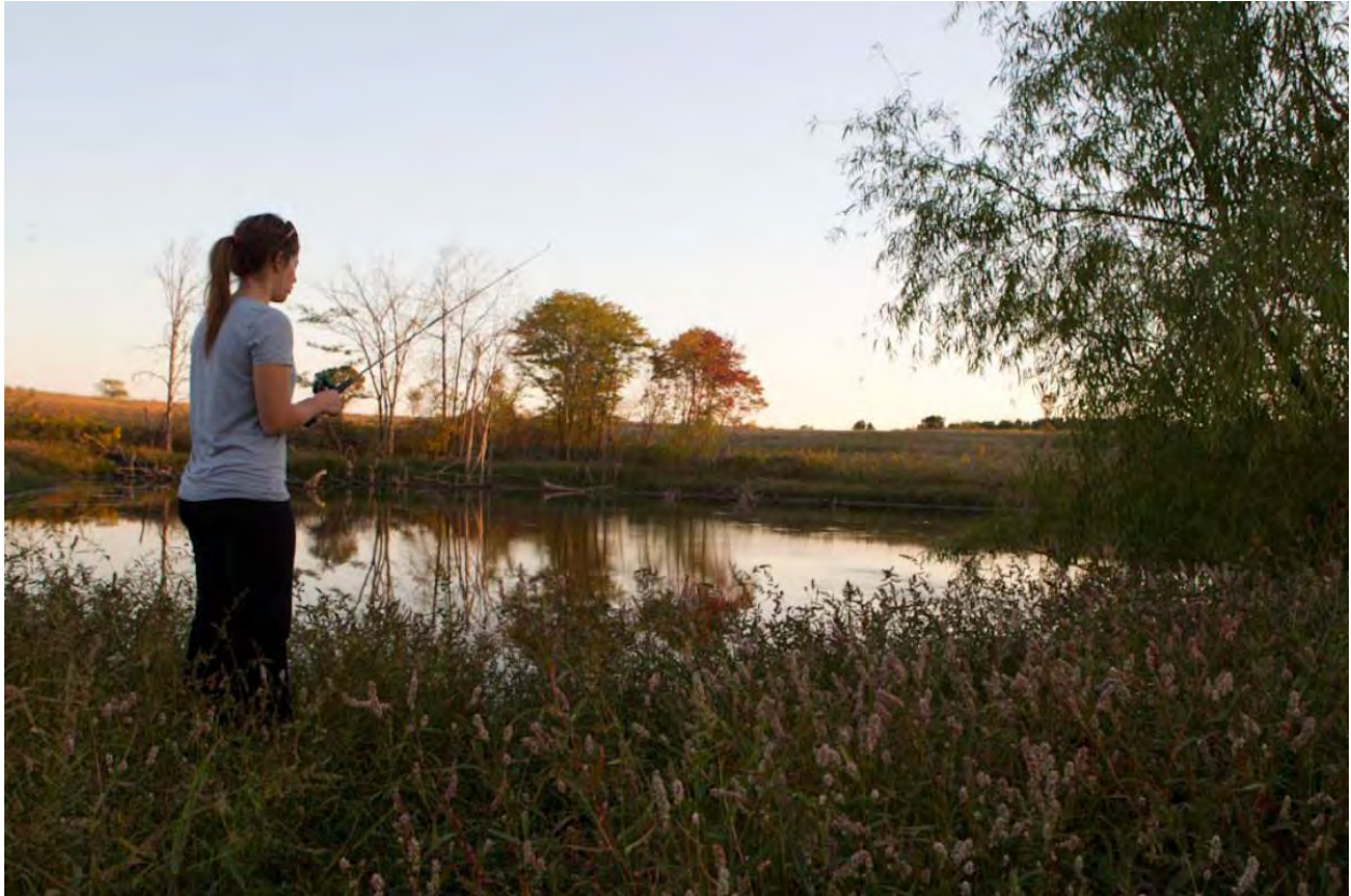
Bunch Hollow Conservation Area

Missouri Department of Conservation February 2014