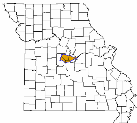
Figure 10. General location of the Moreau River Watershed, in Missouri.